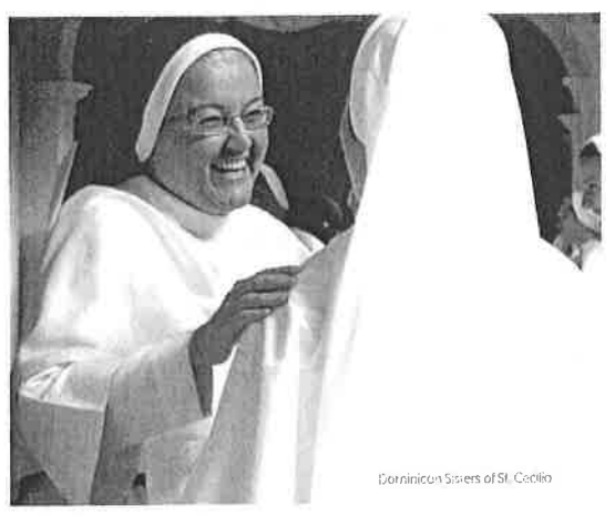
Dominican Sisters of St. Cecilia